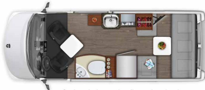
Optional alternative floor plan daytime