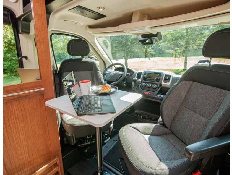
Spacious front dining area comfortably seats two.