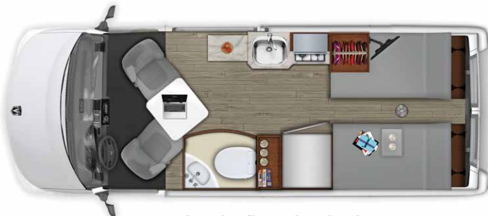
Interior floor plan daytime.