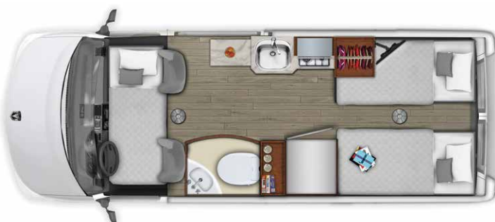
Interior floorplan evening with twin bed set up. (Shown with optional front folding mattress.)