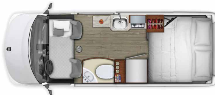
Interior floorplan evening with king bed set up. (Shown with optional front folding mattress.)