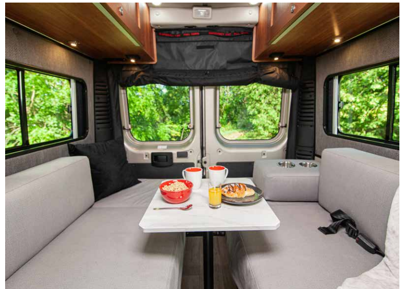
Rear lounge and twin bed area offers a great place to relax, work or dine and easily transforms into a king sized bed.